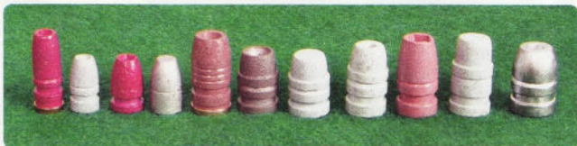
This is just a smidgeon of MP's "cast of characters." Notice how most are HPs.

I ordered a 0.433" 300-gr. HP mold with three crimp grooves strategically placed for Marlin .444 rifles and .44 Magnum