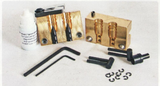
MP molds come with Allen keys, clips, HP and solid pins and a bottle of sprue-plate lube. The sprue-plate bolt has an Allen set-screw to keep it locked in place as the plate swings back and forth during casting sessions.

handguns. I transferred funds via Paypal and received it in about two weeks. International trade!